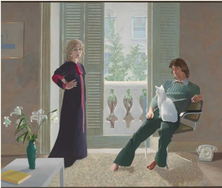
Mr and Mrs Clark and Percy © David Hockney (1968) TATE Acrylic paint on canvas